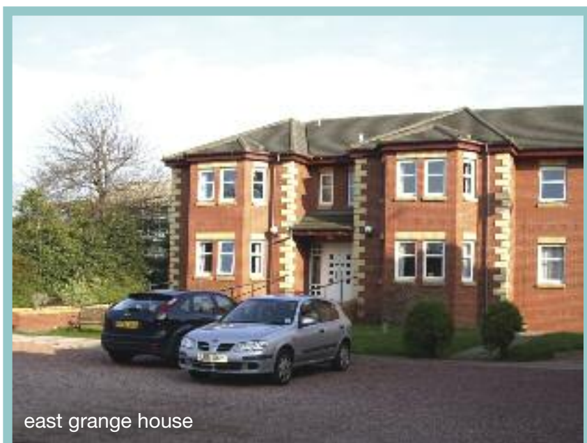
east grange house