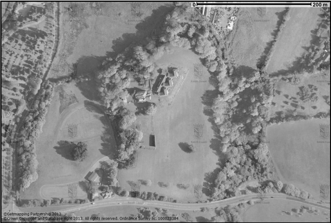
Note: The larger building has been demolished since this aerial photograph was taken

Weedingshall is currently used for the Educational Assessment Unit which teaches secondary age pupils with behavioural and emotional difficulties. This unit is being merged with the Falkirk Day Unit in Camelon and Weedingshall is no longer required for this purpose.