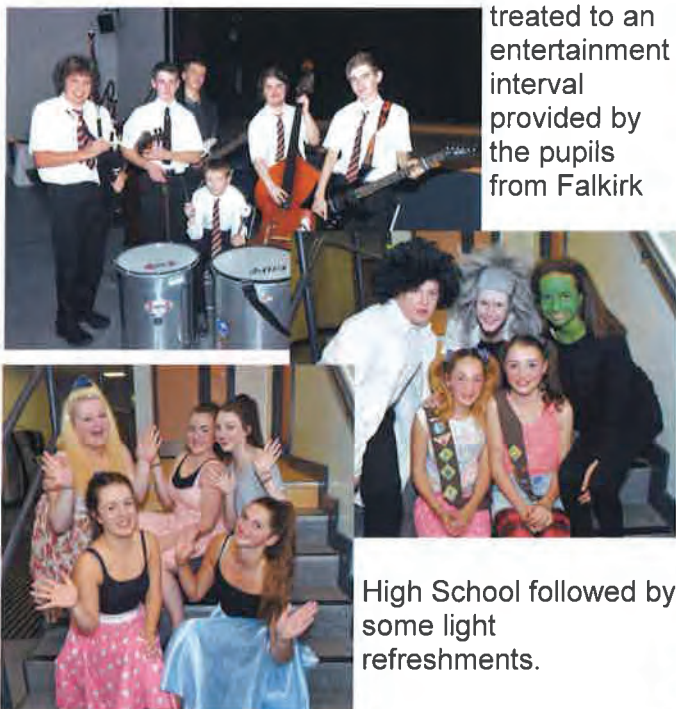
High School followed by some light refreshments.

After this award was presented, the audience was treated to an entertainment interval provided by the pupils from Falkirk