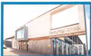
Wider Access to School Project (WASP) Denny High School, Denny, FK6 6EE 01324 822895