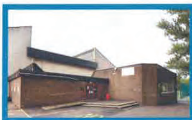
Bonnybridge Education Centre Bridge Street, Bonnybridge, FK4 1AA 01324 503290