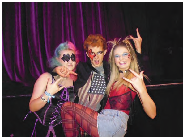
Fairies – great make up and costumes