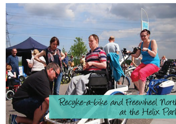
Recycle-a-bike and Freewheel North at the Helix Park

"I know I can just pick up the phone or email if I need help/information... having access to training... it's just fantastic that there are people out there that actually want to help and support you". -local social entrepreneur, April 2014