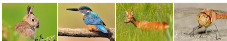
local activities, events, workshops, adventures and fun activities, that celebrate our natural heritage

Nature-Fest Falkirk Area Wildlife Festival