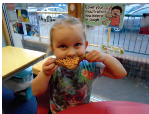
Triangle shaped toast!