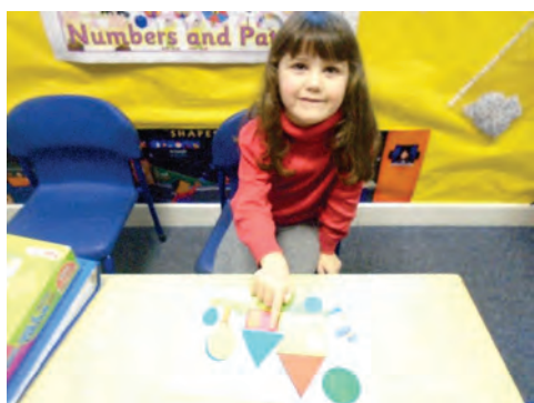
I can name my 2D shapes!