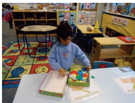
A shape game!