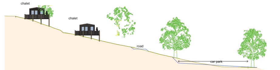
S-22 Section 1:200