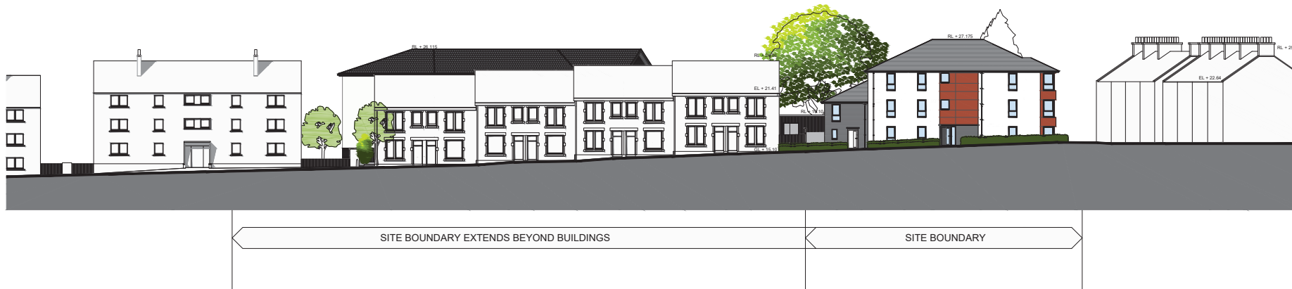
KING STREET ELEVATION