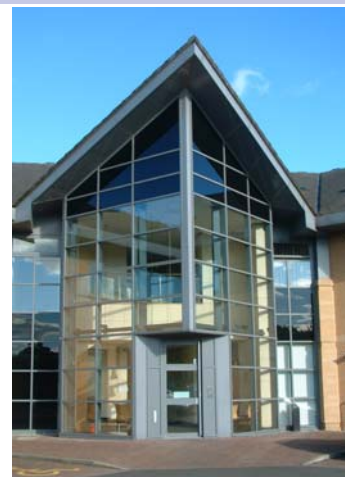
Glenberrie Business Park