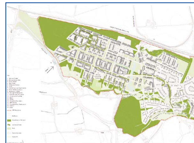
Whitecross Draft Masterplan

The Falkirk Council Structure Plan 2007 promotes Manuel Works/Whitecross as a location for major growth and regeneration. It is identified as a SIRR (Strategic Initiative for Residential Led Regeneration) for up to 1500 new houses, with associated social and physical infrastructure, including a new primary school, open space, canal-related opportunities and a Strategic Development Opportunity for major employment uses. The Falkirk Council Local Plan, sets out a boundary for the SIRR and a set of guidelines for the development of this new community.