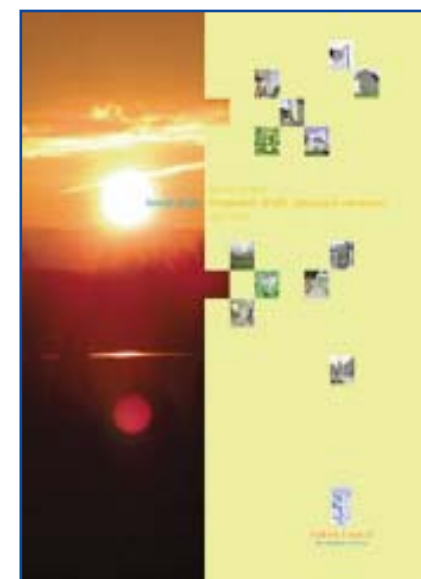
Local Plan Inquiry - Finalised Draft

The Public Local Inquiry into objections to the Falkirk Council Local Plan drew to a close at the end of June, marking another significant milestone in the preparation of the plan.