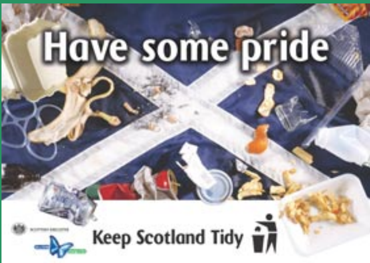
Keep Scotland Beautiful

The end of February saw the launch of a new campaign to raise the profile of litter as a key local problem. The message will be displayed on the sides of some of the larger Council vehicles, litter and dog bins initially, with a further series to follow throughout the year.