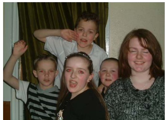
Some of our P7 pupils had a great time at Dounans Outdoor Centre