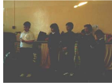
P6/7 used ICT to create a short video about school events.