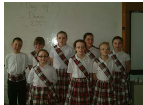
Once again, pupils from Avonbridge Primary School took part in the 'Day of Dance'