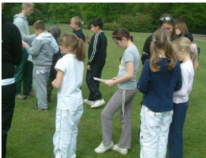
P6/7 took part in the Orienteering Festival at Callendar Park.