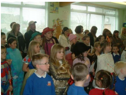
We invited parents/carers to our Book Afternoon