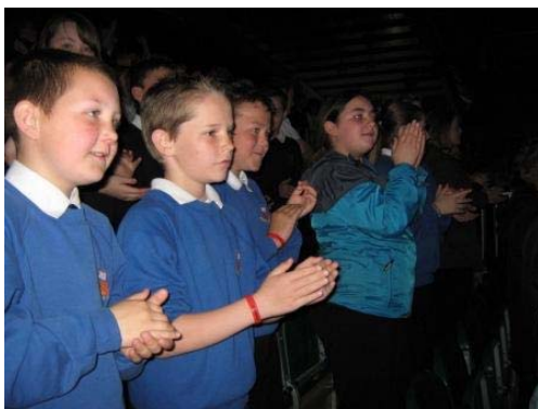
P7 pupils enjoyed themselves at 'Choices for Life'.