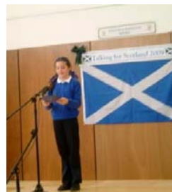
Pupils took part in the Small Schools 'Talking for Scotland' competition.