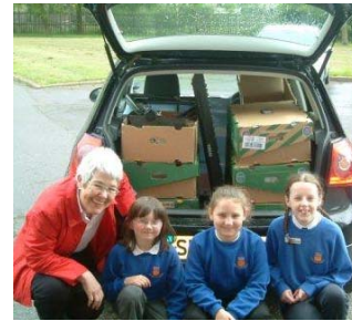
The school pupils are working towards their green flag. As part of our recycling we donated books to the Malawi project organised by 'Falkirk Churches Together'.