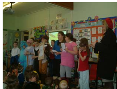
Some of the pupils dressed up as their favourite book characters for our Book Week in February