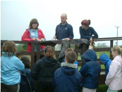
P6/7 learned about the Countryside Code on their visit to Argaty Farm.