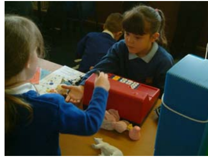
P1/2 pupils learned about money after by being shopkeepers and customers.