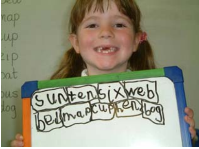
P1/2 pupils wrote simple words looking at picture cards and sounding out the words.