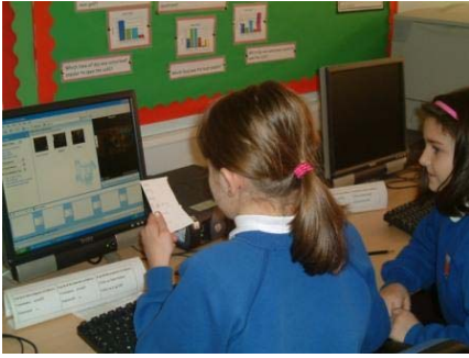
P3/4/5 performed at our Burn's Afternoon.