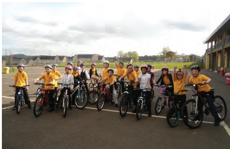
Commonwealth Sports Group