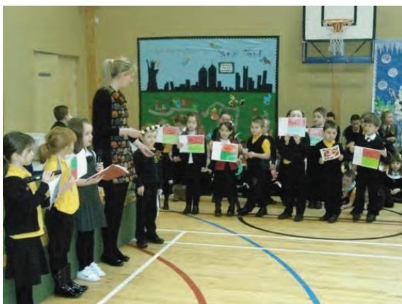
P2/1 Learned about Madagascar

Timezone enjoyed learning about different African countries during our Africa focus week. We collected donations from the children to send to our link school in Niger which a family in our school visits annually. We learned about the variety of cultures, landscapes, languages and schools in many African countries. Pupils in the Timezone