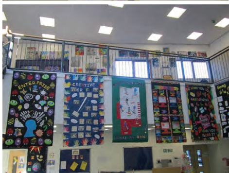
Our new school banners!