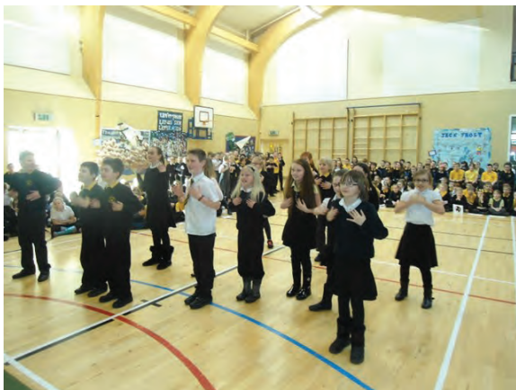
A Zimbabwe Dance led by P5

Our whole school including the nursery and the