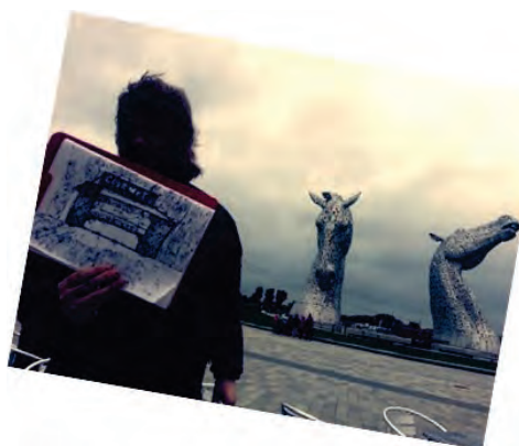
Eoghan's winning design

extremely fruitful for all pupils involved and I wish to congratulate them on their successes.'