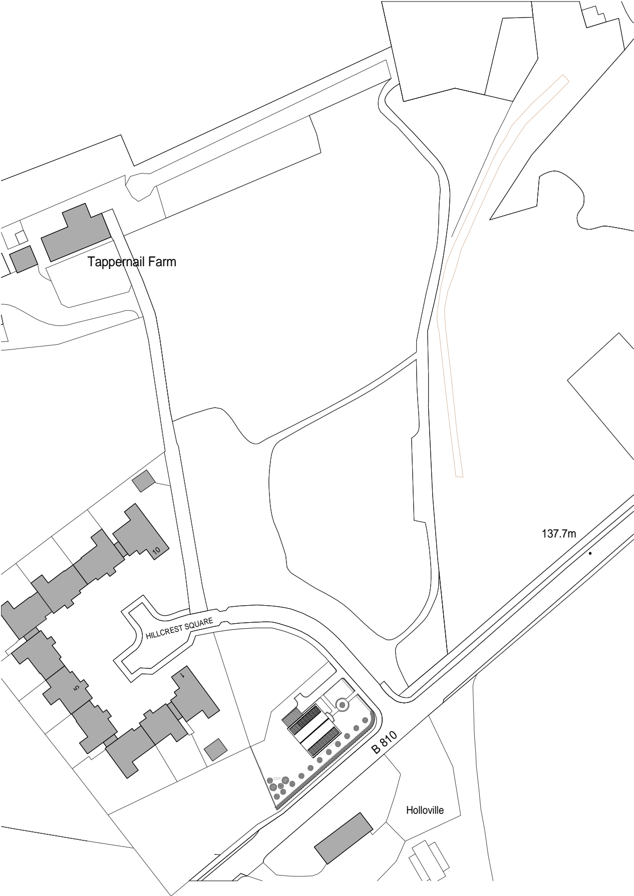
Location Plan 1:1250 @ A3