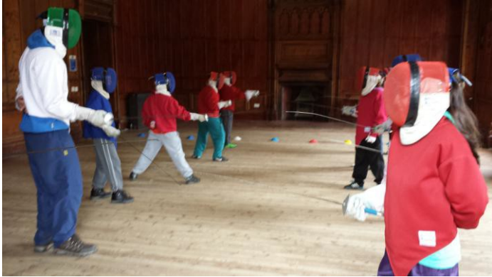
P7 having fun at Dalguise

Falkirk Council has a responsibility to provide an education for all pupils and to challenge and address bullying behaviour. Whilst appropriate action will be taken by the school, it is also important that all parents involved, work with the school to resolve any issues in the best interests of their child or young person.