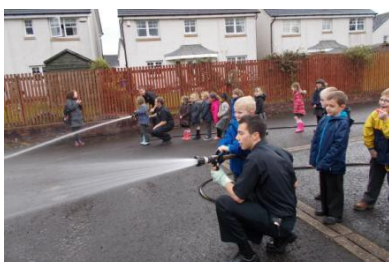
P2 visited the Fire Station as part of their topic work.

If you have any queries regarding the school's dress code, please contact the Headteacher.